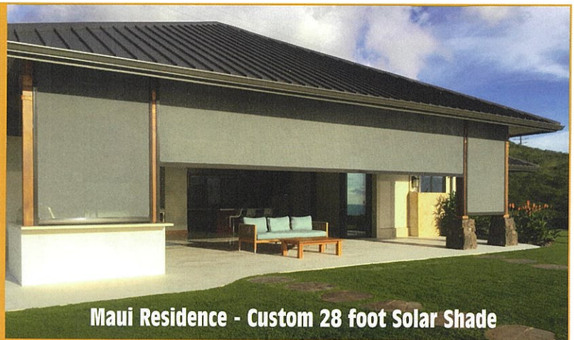
Maui Residence - Custom 28 foot Solar Shade

Shading Maui for 12 years SkyShadesHawaii.com